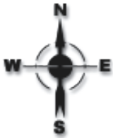
Sketch Floor Plan

Land Size _____ No. of Rooms _____ Construction - Roof _____ Walls _____ Water Pressure _____ No of Bathrooms _____